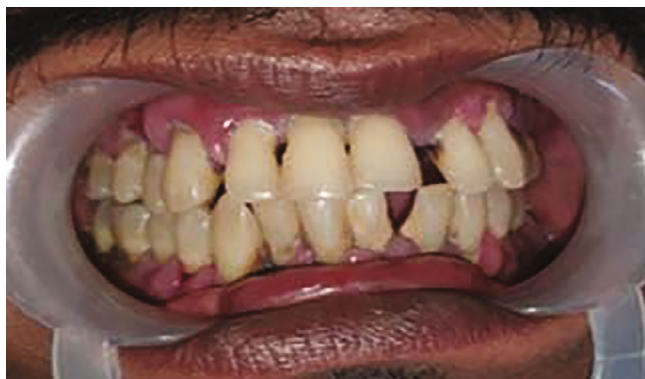
FIGURE 1: Clinical oral examination.