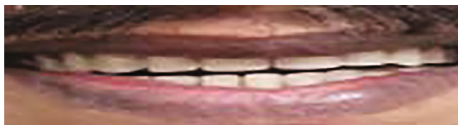
FIGURE 3: Oral examination after Immediate denture replacement (after 3 months).