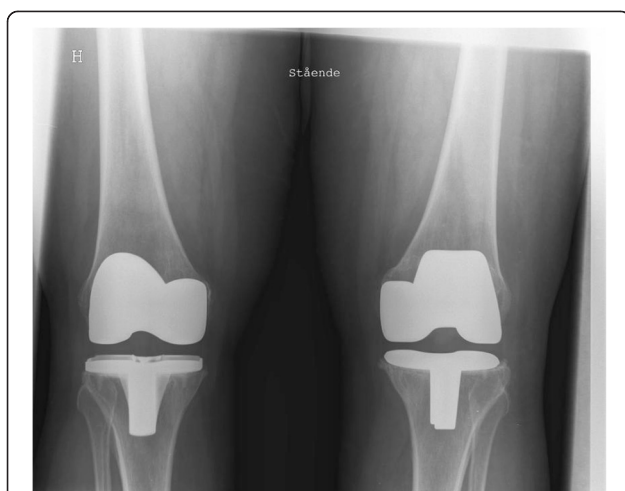
Figure 2 Anteroposterior radiograph showing the knees of a standing patient 1 year postoperatively. H: Right knee, LPS-Flex (Zimmer®). Left knee, AGC (Biomet®).

blood pressure) from incision until cementation was finished. No lateral releases were performed, and patella was resurfaced in all cases. Thorough cleaning of osteophytes from the back of the knee and release of the posterior capsule from the femur was completed in all cases. At the end of surgery all knees had a ROM from full extension until the calf met the thigh. Tranexamic acid [15] was administered routinely. Drains were not used; postoperative cooling was used at the patients' discretion during hospitalization. All patients received a standardized combined spinal-epidural anesthesia. Oral pain treatment consisted of Paracetamol (1 g x 4), NSAID and opioid at regular intervals and upon request.