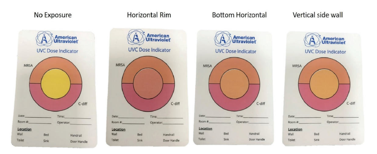
Figure 3 . Pictures showing colorimetric indicators (UVC Dose Indicator, American Ultraviolet) placed adjacent to organism inoculation sites shown in Figure 1 during 30-second UV-C cycles. The color of the central circle indicates the level of UV-C exposure: yellow, no exposure; orange, dose sufficient to inactivate methicillin-resistant Staphylococcus aureus (MRSA); pink, dose sufficient to inactivate Clostridioides difficile spores.

Figure 3 shows changes in the UV-C colorimetric indicators with the 30-second duration UV-C treatment at each inoculum site. The 30-second treatment resulted in a color change from yellow (untreated) to orange indicating delivery of a sufficient dose to reduce MRSA at each test location.