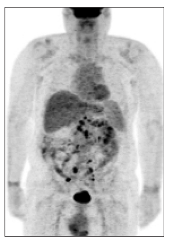
Figure 2: Post treatment; positron emission tomography scan performed 1-year after the beginning of the treatment which reveals complete resolution of the previously seen liver lesions