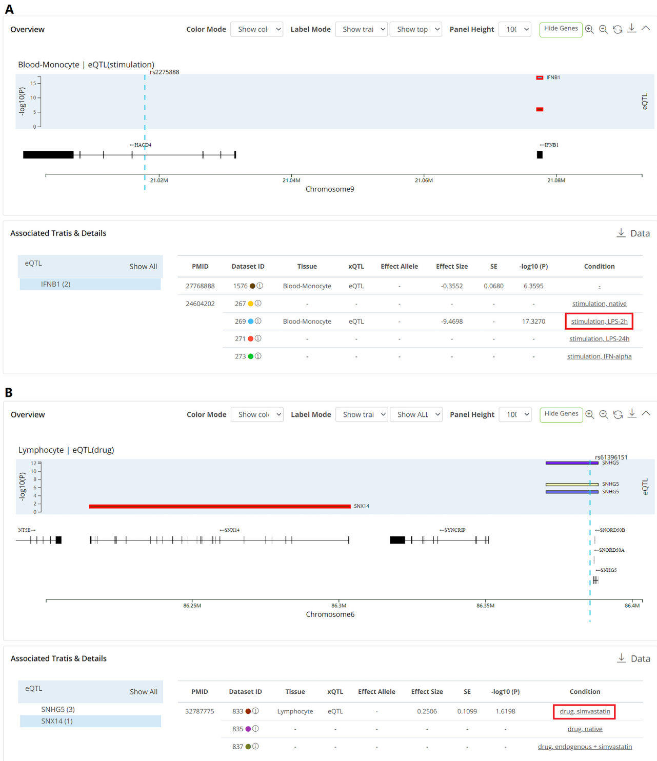
Figure 2. Investigating eQTLs across different biological conditions in QTLbase2 ‘Comparison Viewer’. (A) rs2275888 displays a stimulus-specific genetic effect on IFNB1 expression in monocytes only after 2-h LPS treatment; (B) rs61396151 exhibits a weak context-specific genetic effect associated with SNX14 expression in lymphocytes after simvastatin treatment.