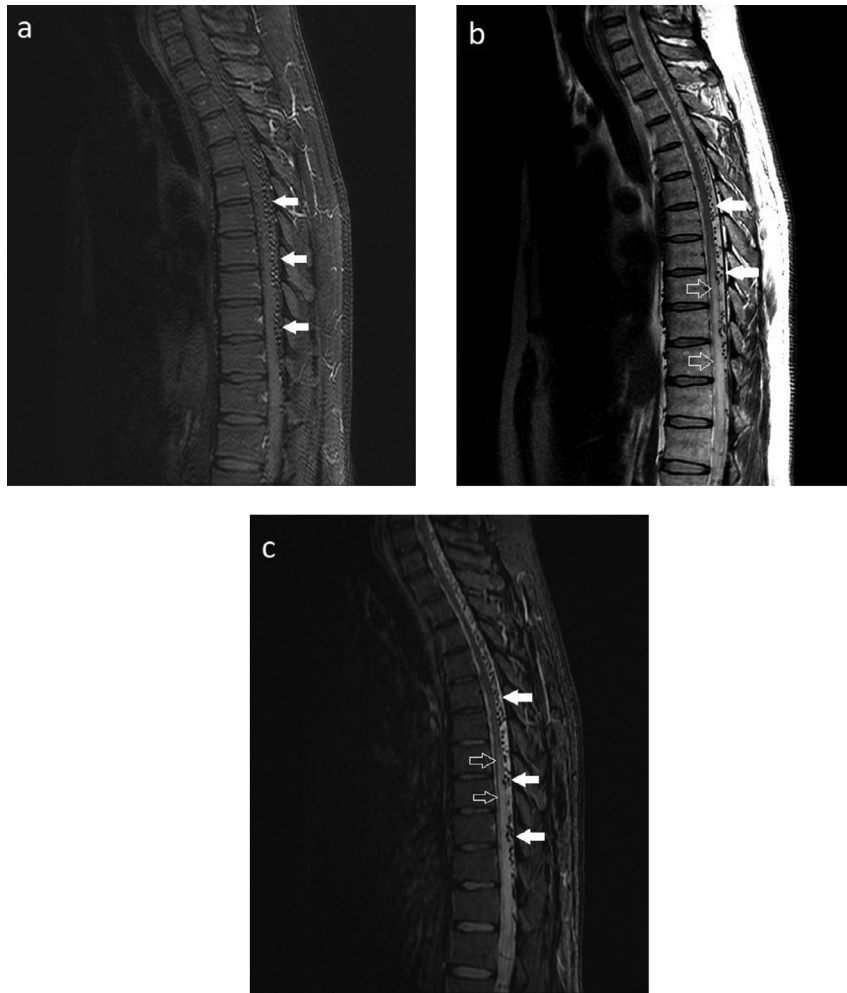
Fig. 1 – (A-C). Sagittal T1W with gadolinium (A), T2W (B), and T2W STIR (C) MR images illustrating abnormally dilated perimedullary vessels in the posterior epidural space of the entire thecal sac of the dorsal and lumbar regions which shows signal voids from high-velocity flow (white solid arrows). Edema and swelling of the mid-dorsal cord down to the conus medullaris are also noted (white hollow arrows).

a single giant AVF and extensive ectatic venous drainage (Sub-type III) [1-3].