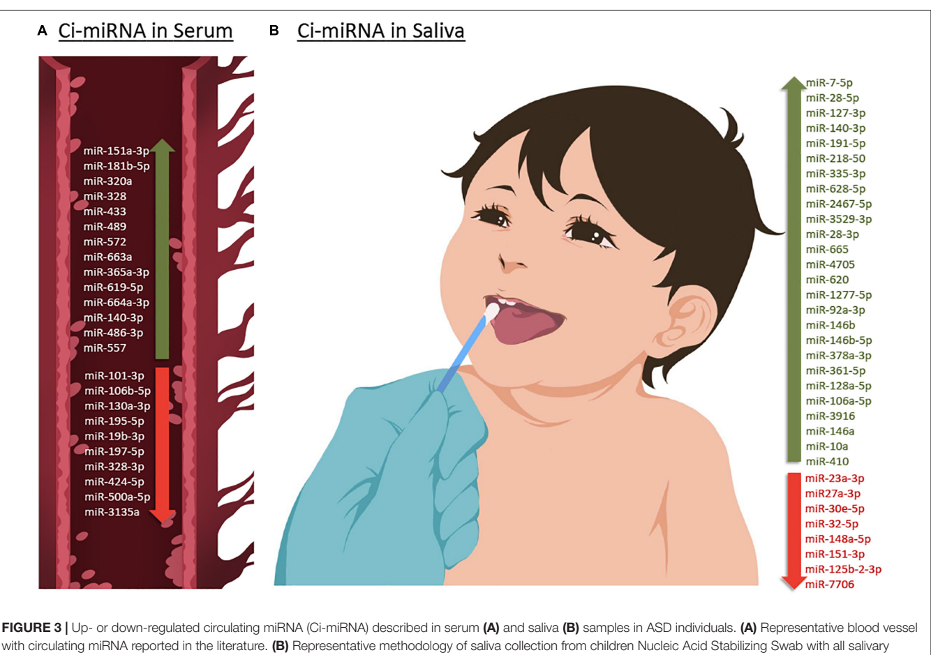
with circulating miRNA reported in the literature. (B) Representative methodology of saliva collection from children Nucleic Acid Stabilizing Swab with all salivary miRNA reported in the literature. Green arrow pointing upwards refers to miRNA that are described to be upregulated in serum and saliva in ASD individuals. While red arrow pointing downward refers to miRNA that are found to be downregulated.

the target genes of miR-3135a and miR-328-3p are involved in neurodegenerative diseases, but their involvement in ASD is yet to be clarified (Popov et al., 2018).