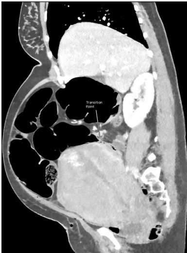
Figure 2: CT abdomen and pelvis with venous phase contrast, sagittal view. Abrupt collapse of the gas-filled sigmoid colon is shown posterior to the enlarged uterus. Subcutaneous gas in the anterior abdominal wall is from recent surgery.

and liver function. A computed tomography (CT) abdomen and pelvis was organized to rule out mechanical obstruction.