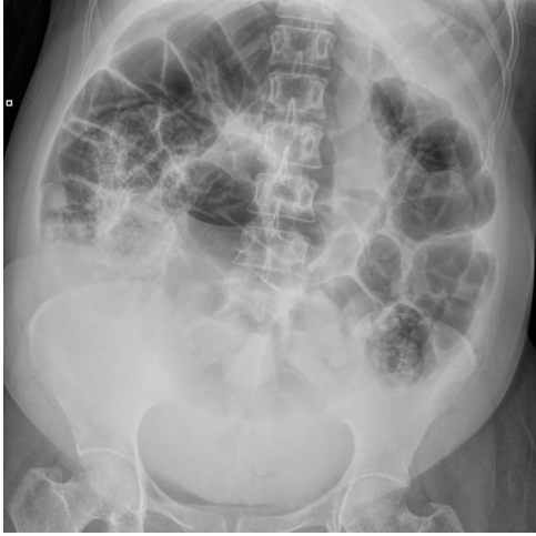
Figure 1: X-ray Abdomen, 24 h after commencement of symptoms. Widespread dilatation of large and small intestines stopping at the level of the pelvic brim. Moderate faecal loading in the caecum and descending colon.