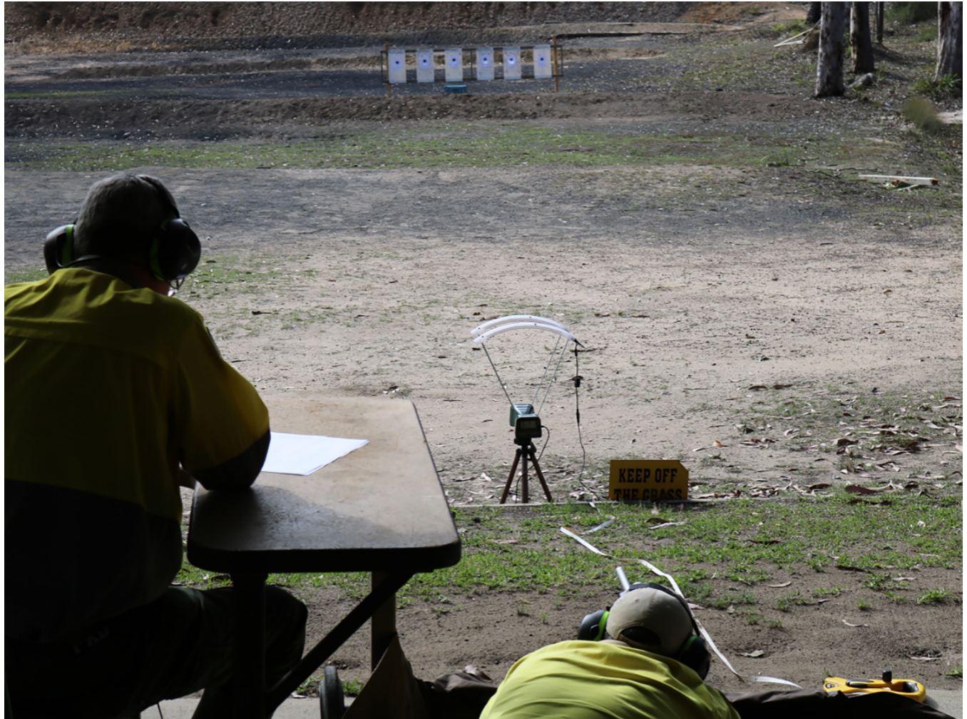
Fig 1. Shooting range testing of lead-based and lead-free bullets. Photographs of the use of a standardized shooting approach using paper targets to assess accuracy and precision and a chronograph to measure muzzle velocity.

https://doi.org/10.1371/journal.pone.0247785.g001