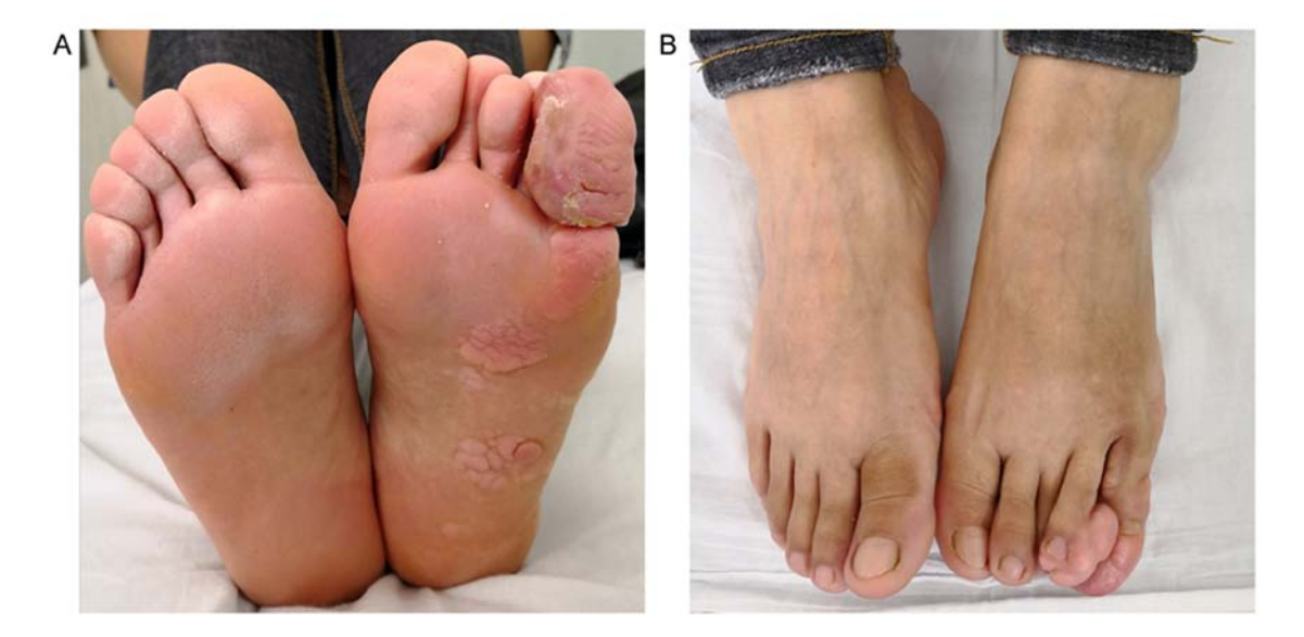
Figure 1. (A) Macrodactyly and cerebriform plantar hyperplasia on the left foot. (B) Enlarged fourth and fifth toes with irregular bulges.