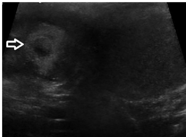
Fig. 1 – Scrotal ultrasound showing heterogeneous right scrotal mass with anechoic center suggestive of necrotic component.

TB Peritonitis is difficult to diagnose, primarily due to its insidious onset and variability in radiographic findings. The CT findings in patients with tuberculosis peritonitis include ascites with the ascitic fluid demonstrating high attenua-