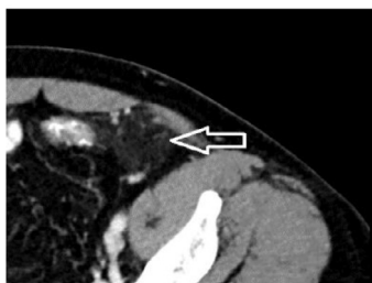
Fig. 3 – CT abdomen shows nonspecific fat stranding.