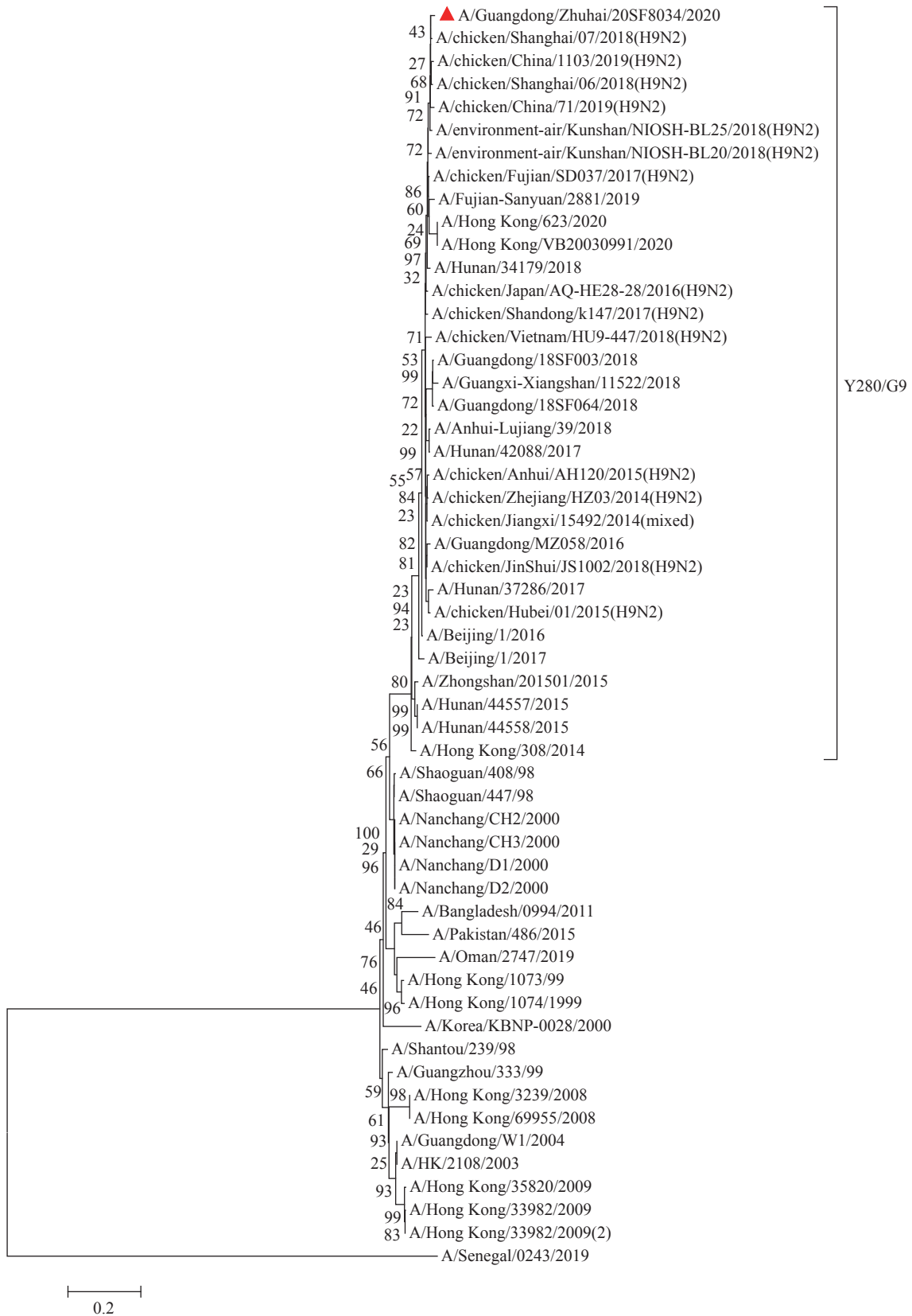
FIGURE 2. Phylogenetic tree based on neuraminidase (NA) gene sequences of the isolated virus strain A/Guangdong/Zhuhai/20SF8034/2020 (H9N2) and the reference strains using the maximum likelihood method. A red solid triangle marked the location of A/Guangdong/Zhuhai/20SF8034/2020(H9N2).