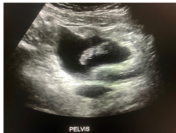
Fig. 3. Pelvic ultrasound.

examination, the patient was in pain, (weight: 48.45 kg, Height: 141 cm and BMI: 25 kg/m 2 ). All his vital signs were stable.