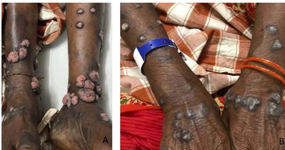
Figure 1 (A & B). Multiple, well-defined, discrete, hyperpigmented, hyperkeratotic, scaly lesions on the extremities.

The lesions over the lower legs did not respond to topical steroids and underwent excision of multiple lesions, as per her request. As she was depressed due to the generalized disease, counseling was initiated. She was seen after 3 months with lesions appearing flat, not flaring up, no new lesions and pain free.