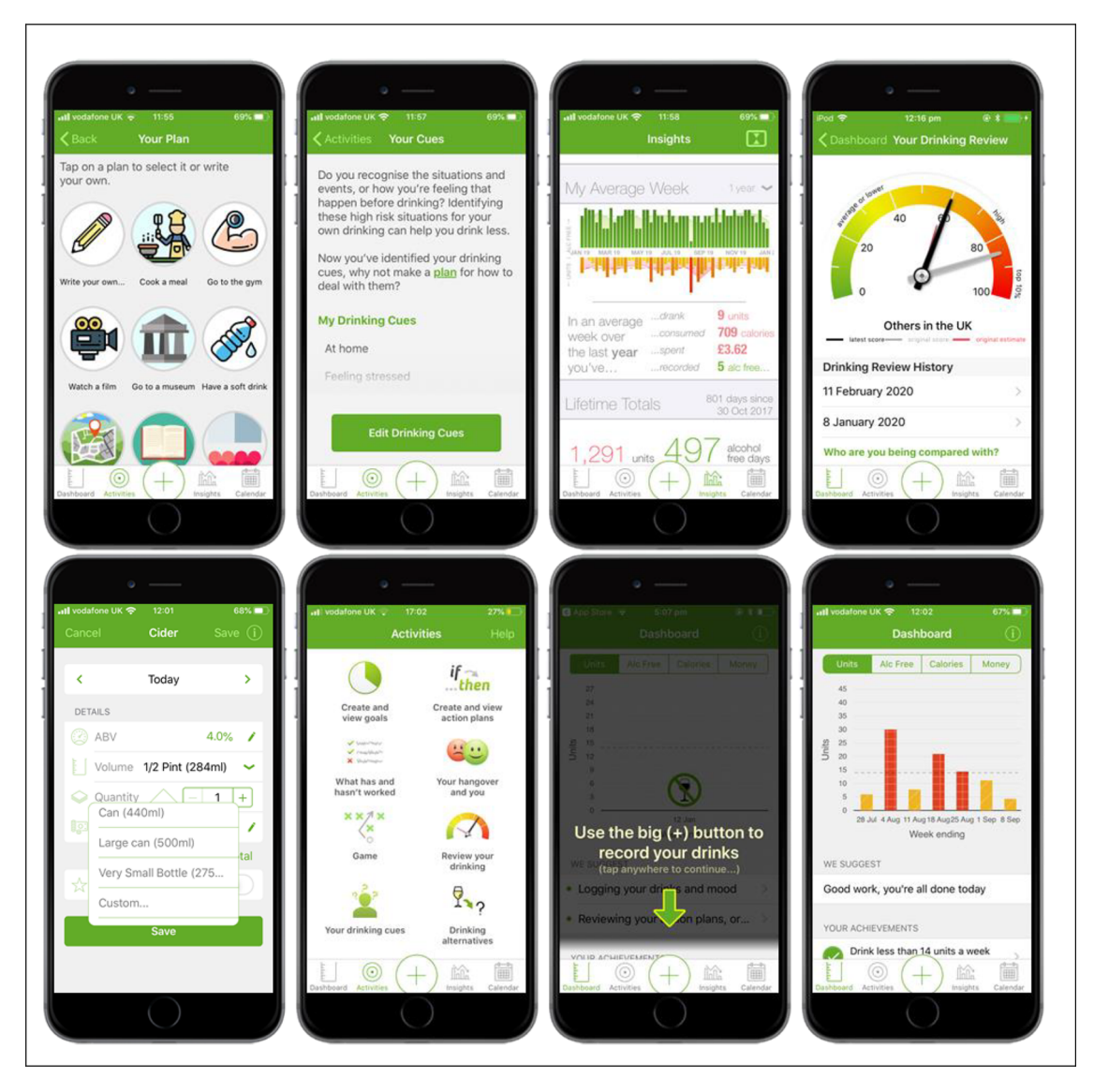
Figure 2. Screenshots from the refined version of the Drink Less app.

preferred the design as bar graphs (Phase 3). The final 'Insights' module, labelled 'Insights' in the app, consists of one screen with three sections: My Last Week, My Average Week, and Lifetime Totals. My Last Week and Lifetime Totals showing the total number of units, money spent, calories consumed, and alcohol-free days as well as a summary of their goals. My Average Week shows their average week in terms of units, calories, cost, and alcohol free days over different user-selected time periods: one month, three months, six months, one year, lifetime, with a graphical representation of their weekly units and alcohol free days. See Figure 2 and Supplementary Figure 3 (Extended data: https://osf.io/5y7pc/) for screenshots of the 'Insights' module.