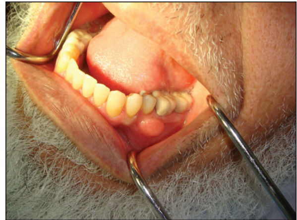
Figure 1 A dome-shaped nodule present at the left buccal mucogingival junction.

The specimen resected was routinely processed and stained with hematoxylin and eosin, as well as with anti-CD34 (QB-END, 1:50;