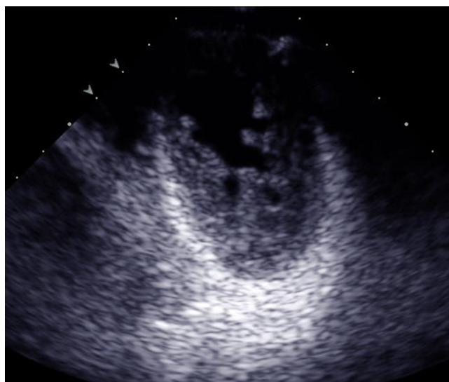
Figure 3 Apical short-axis view shows numerous, excessively prominent trabeculations associated with intertrabecular recesses by two-dimensional echocardiography.