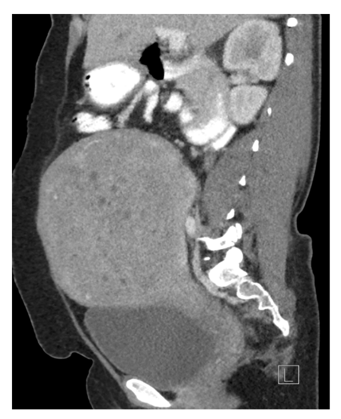
Fig. 1. CT sagittal view of pelvic mass.

applicator for intracavitary high-dose-rate brachytherapy will not cover the uterus adequately. Therefore, it was recommended to proceed with surgical resection.