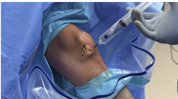
Fig 1. The 20-mL syringe (*) with a 25-gauge needle used to infiltrate 10 mL of the mixed local anesthetic to each portal site (ˆ) and the surrounding capsule to anesthetize the area of the left knee in a supine position.

After insertion of the scope, a standard diagnostic arthroscopy is performed. The diagnostic procedure is started by first examining the patellofemoral joint to include the articular surface of the trochlear groove of the femur and the medial and lateral facets of the patella for any signs of chondral wear and inflammation. The scope and operative limb are then manipulated to allow visualization of the lateral gutter to assess the lateral joint capsule and the deep fibers of the lateral collateral ligament, as well as the lateral borders of the lateral femoral condyle and tibial plateau. The scope is then placed in the lateral compartment of the joint to assess the lateral meniscus for tears, the lateral femoral condyle, and lateral tibial plateau for any defects or signs of chondral wear and the deep fibers of the popliteus tendon posteriorly. Next, the intercondylar