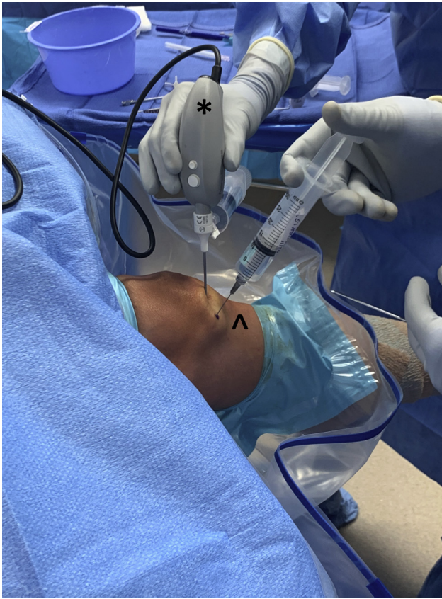
Fig 4. The needle arthroscope (*) is inserted into the knee joint through the primary medial portal site with a posterior and lateral trajectory aimed at the intercondylar notch of the left knee in a supine position. An additional 0.25% bupivacaine is then injected into the accessory medial portal (^).

compartment is visualized to assess the anterior and posterior cruciate ligaments, along with the anterior and posterior menisiofemoral ligaments, for any signs of fraying or tearing.