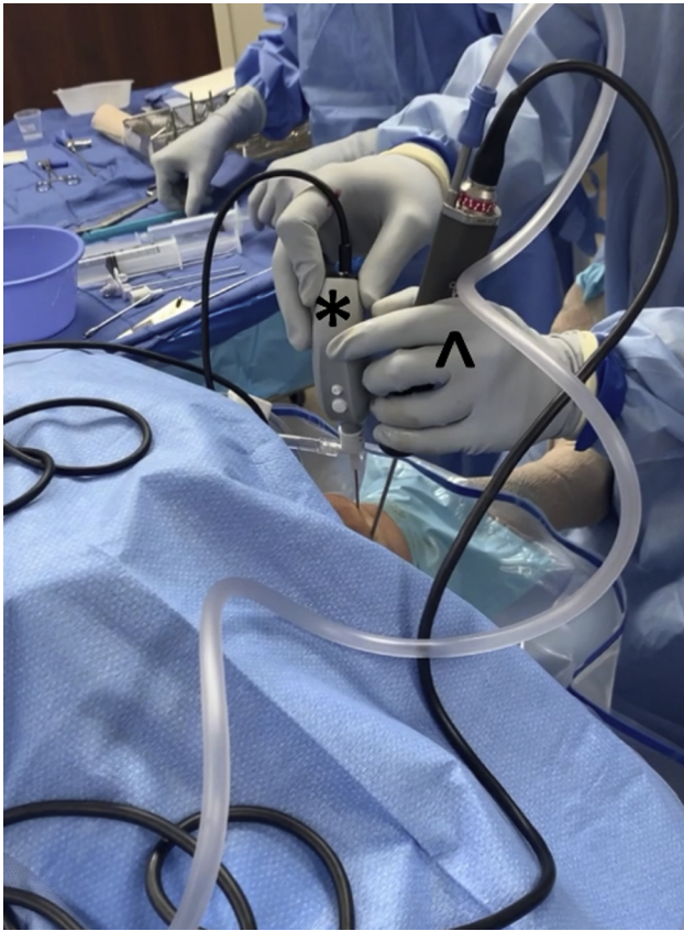
Fig 6. The arthroscopic shaver (∧) is placed under visualization of the needle scope (*) through the accessory medial portal site to clear the joint of meniscal debris and further refine the meniscus tear during partial medial meniscectomy of the left knee in the supine position.

as tolerated and is instructed to ice the area and take nonsteroidal anti-inflammatory drugs as needed.