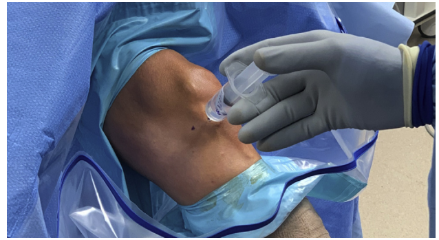
Fig 2. Intra-articular injection of 20 cc of 0.25% bupivacaine through the use of a syringe with a spinal needle to achieve intra-articular anesthesia of the left knee in the supine position.

The patient is placed supine on the operating table with the operative lower extremity supported in an arthroscopic leg holder. The limb is prepped with ChlorPrep scrub (Becton, Dickinson and Company, Franklin Lakes, NJ) and then draped in standard sterile fashion to allow for access to and manipulation of the surgical site. A stockinette is placed over the foot and ankle and secured in place just distal to the tibial tuberosity with Coban wrap. The portal sites are marked on the operative extremity. These include primary medial and lateral portals, which are positioned just above the joint line 1 cm medial and lateral to the edge of the patella tendon respectively. Accessory working portals are marked at the joint line 1 to 2 cm medial to the standard medial portal and 1 to 2 cm lateral to the standard lateral portal. The 20-mL syringe with a 25-gauge needle is used to infiltrate 10 mL of the mixed local anesthetic to each portal site and the surrounding capsule to anesthetize the area (Fig 1). Subsequently, the 20 cc of 0.25% bupivacaine is then injected intra-articularly (Fig 2). The needle arthroscope is connected to the viewing tablet in sterile fashion, and a 60-mL syringe of sterile saline is attached to the inflow port of the needle arthroscopy hand piece. The arthroscopy needle is then inserted into the knee joint through the medial portal site with a posterior and