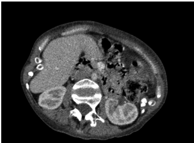
FIGURE 4 Abdominal wall musculature before the BTX injection