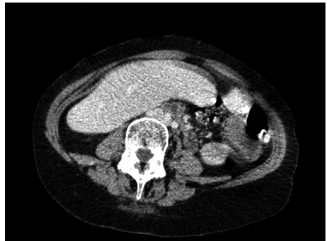
FIGURE 5 Abdominal wall musculature before the BTX injection