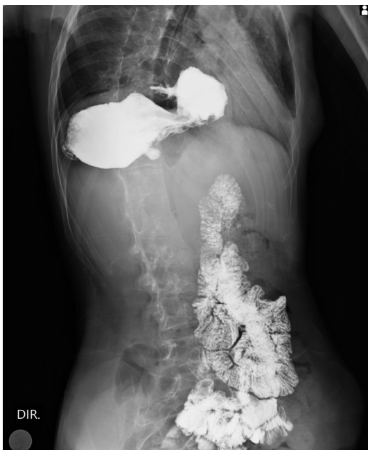
FIGURE 1 Barium swallow test. Giant type 4 hiatal hernia

At seven months' follow-up, the patient had a significant improvement in symptoms. There was no evidence of recurrence in endoscopy (Figure 6).