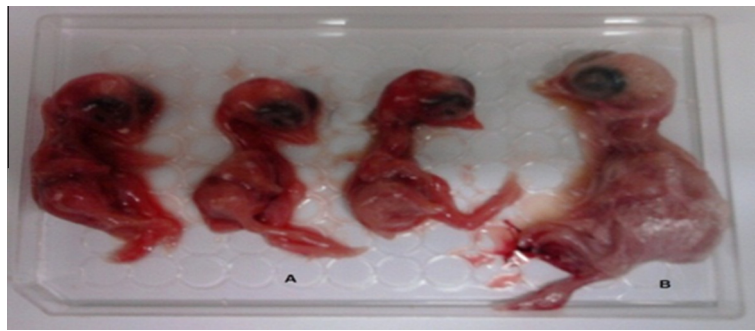
Figure 1 Showing embryonic lesions (A) curled & dwarfed embryos, (B) normal