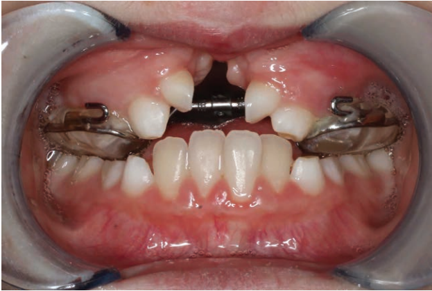
Fig. 1. Preoperative photograph of the fourth patient with necrosed premaxilla.

patient presented with a residual left alveolar cleft despite having undergone bone grafting at an outside institution. The third patient presented with bilateral alveolar clefts. In all three patients, the alveolar clefts extended so far posteriorly that a revision palatoplasty was also required. A fourth patient whose premaxilla necrosed and resorbed after premaxillary setback at an outside institution also underwent reconstruction of the premaxilla with BMP-2 and Grafton DBM (Fig. 1) (Medtronic, Minneapolis, Minn.).