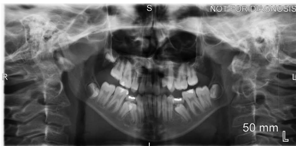
Fig. 4. Panorex film 5 months after left-sided alveolar cleft repair with BMP-2 and DBM.