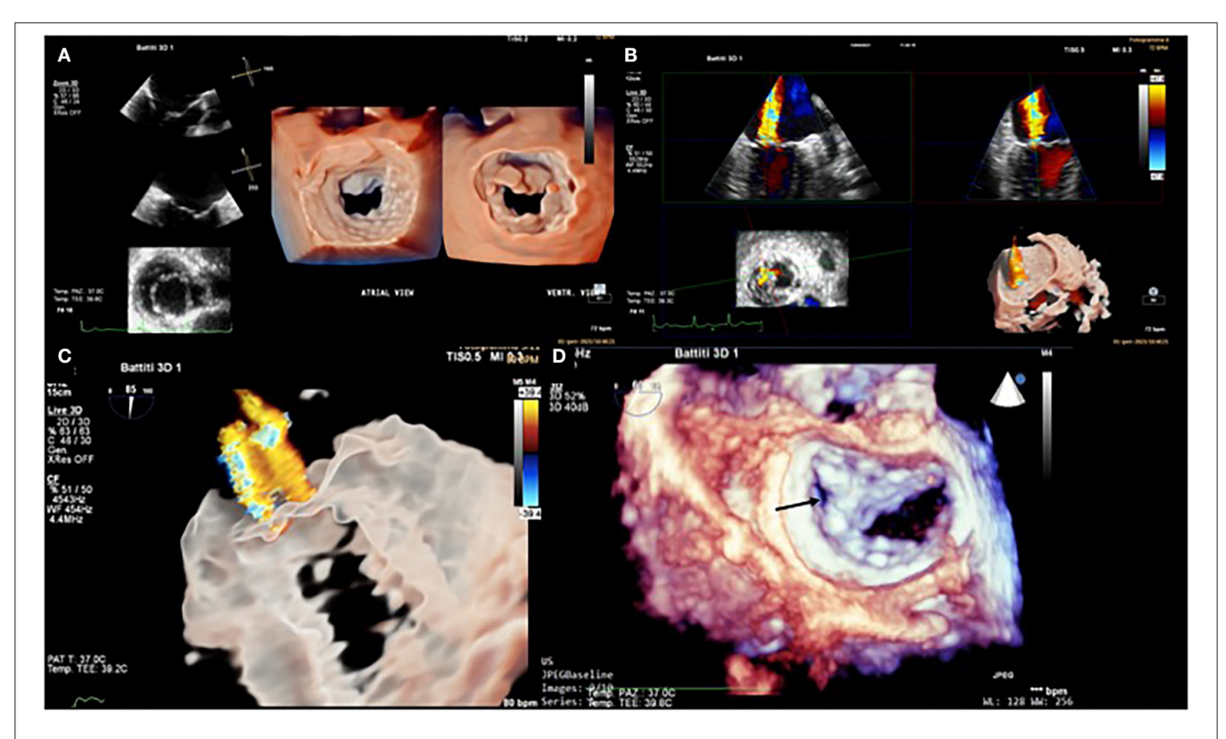
FIGURE 1 | Transesophageal echocardiogram. 3D mitral valve reconstruction with atrial view (or "surgeon's view") and ventricular view sergi (A). Severe mitral regurgitation (MR) was documented with 3D color Doppler acquisition (B). 3D Glass image of MR (C). 3D mitral valve reconstruction (atrial view) after Mitra-Clip system placement in the lateral paracommissural region (black arrow) (D).