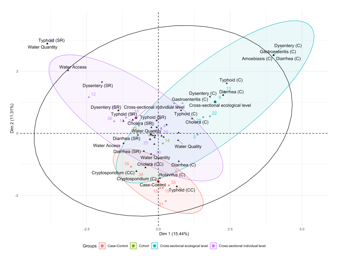
Figure 3. Included studies and study design types, plotted against the first two principal components derived from study design characteristics.

ecological and case control study designs were used in assessing clinically confirmed and culture confirmed health outcomes respectively. Water quantity and quality were mainly assessed using cross-sectional individual and ecological level study designs, whereas water access was mainly assessed using crosssectional individual-level study designs. An unusual combination of self-reported typhoid and water quantity was observed as an outlier (Figure 3). Use of cohort study designs in assessing the association between waterborne diseases and syndromes and water sufficiency was under-utilised.