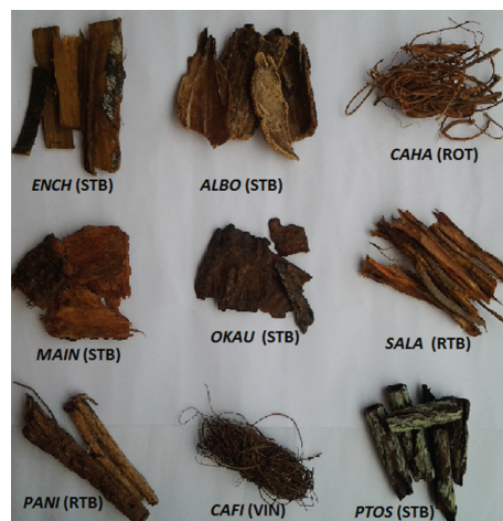
FIGURE 1: Samples of the herbs used in combination as antimalarial herbal formulation (Maloff-HB) in Ogbomoso, Nigeria. ENCH: Enantia chlorantha ; ALBO: Alstonia boonei ; CAHA: Calliandra haematocephala ; MAIN: Mangifera indica ; OKAU: Okoubaka aubrevillei ; SALA: Sarcocephalus latifolius ; PANI: Parquetina nigrescens ; CAFI: Cassytha filiformis ; PTOS: Pterocarpus osun ; STB: stem bark; ROT: root; VIN: vines.