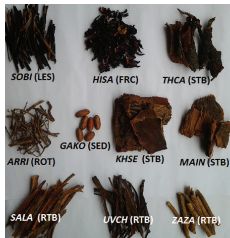
FIGURE 2: Samples of the herbs used in combination as haematonic herbal formulation (Haematol-B) in Ogbomoso, Nigeria. SOBI: Sorghum bicolor ; HISA: Hibiscus sabdariffa ; THCA: Theobroma cacao ; ARRI: Aristolochia ringens ; GAKO: Garcinia kola ; KHSE: Khaya senegalensis ; MAIN: Mangifera indica ; SALA: Sarcocephalus latifolius ; UVCH: Uvaria chamae ; ZAZA: Zanthoxylum zanthoxyloides ; LES: leaf sheath; FRC: fruit calyx; STB: stem bark; ROT: root; SED: seed; RTB: root bark.

The composition of antimalarial and haematonic herbal remedies from Ogbomoso in parts per hundred is shown in Tables 4 and 5, respectively. Not only have the botanicals making up these remedies been documented from this study, but also their relative quantities have been objectively defined. On this account, the two remedies were, respectively, named Maloff-HB and Haematol-B herbal formulations for the purpose of proper identification. On the question whether these formulations are representative of the practice in