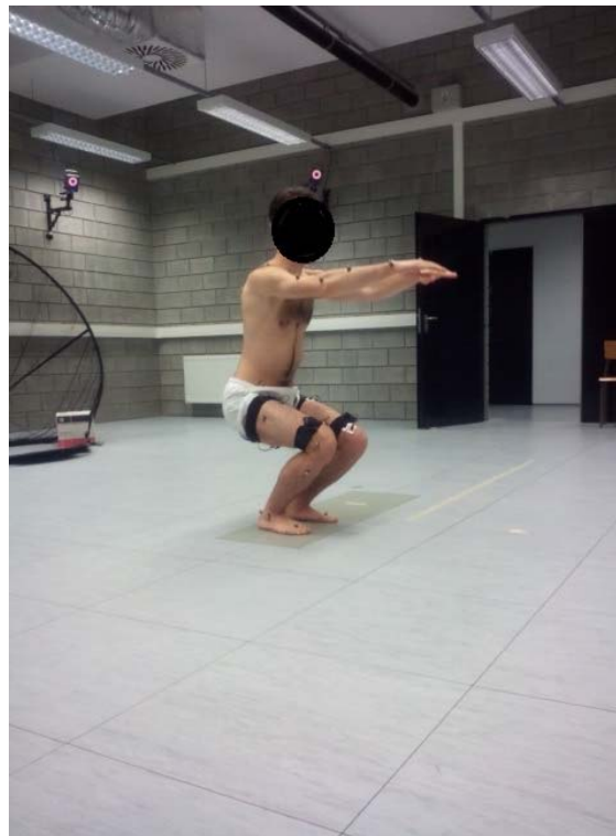
Figure 2 Half squat position during the sEMG measurement.