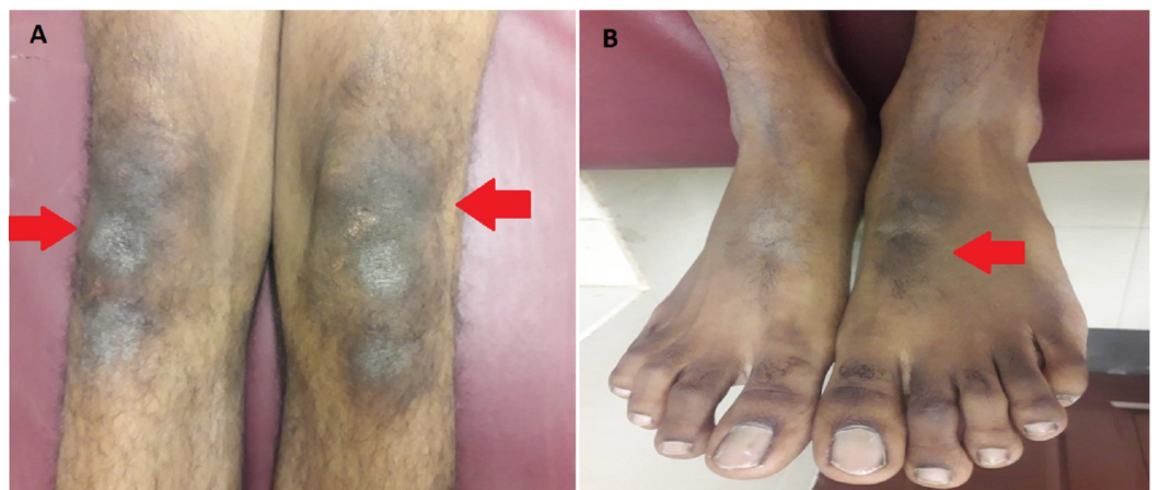
FIGURE 3: Lower limb of the patient; (A) Hyperpigmentation over knees (red arrows); (B) Hyperpigmentation over dorsal surface of foot (red arrow)