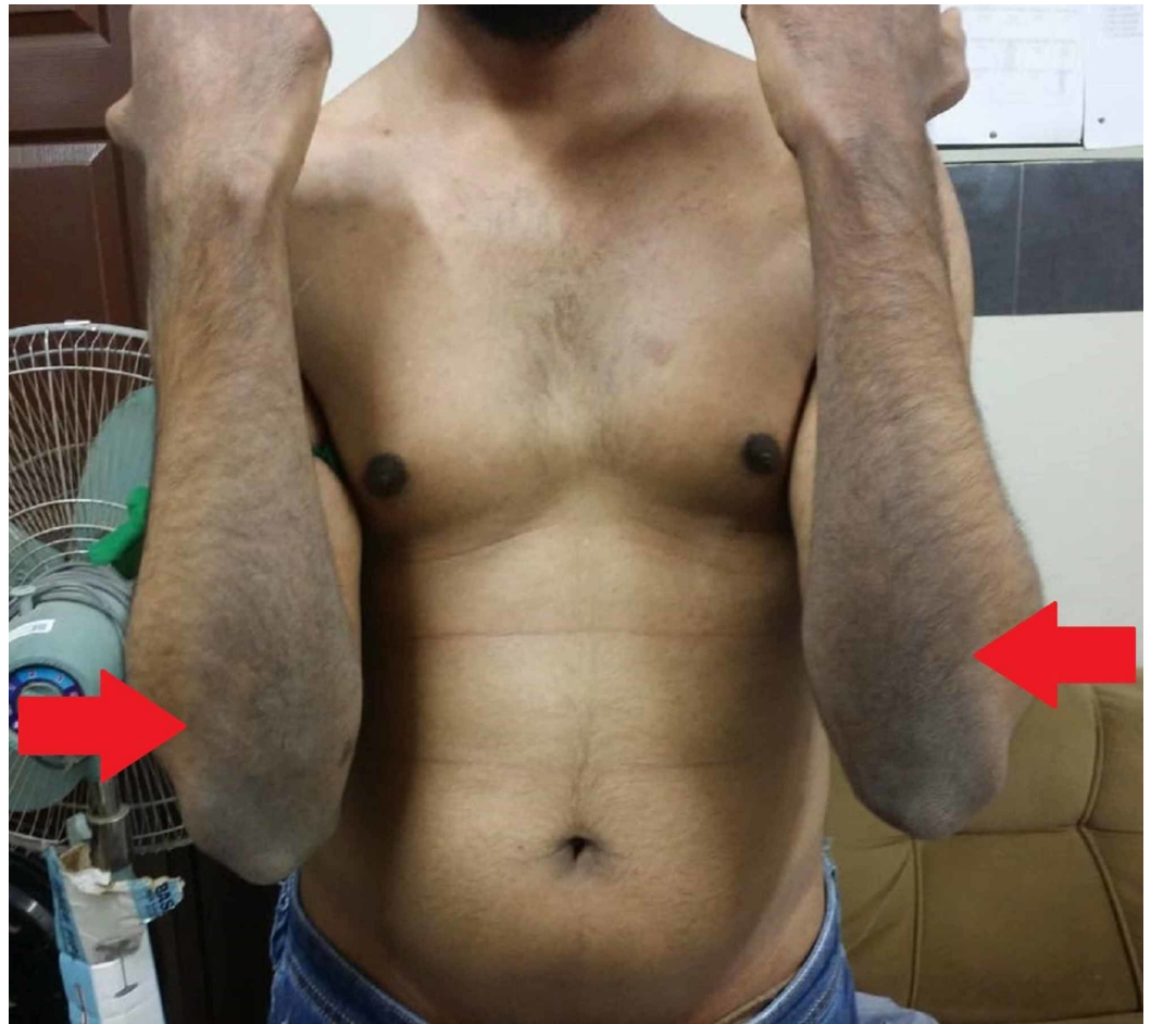
FIGURE 2: Hyperpigmentation on the extensor surface of arms (red arrows)