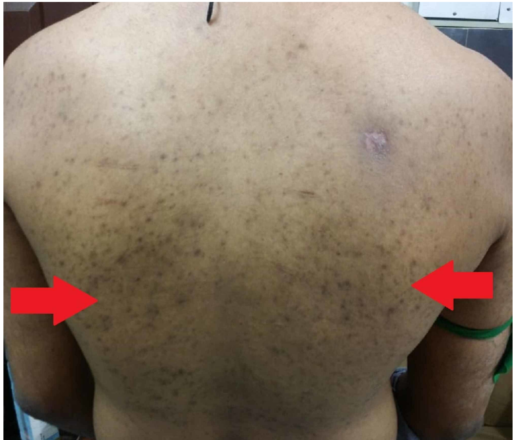
FIGURE 4: Macular rash with acneiform eruptions on the back of patient (red arrows)

In the motor examination for the upper limb, reduction of bulk in both the deltoids, thenar and hypothenar eminences with guttering over first interossei was observed (Figure 1 and Figure 5). On examining the lower limb, a reduction of bulk in the quadriceps muscle was seen. The tone, power, and reflexes were all normal with negative Babinski sign. Mental and sensory examinations were unremarkable. Gait and speech were also normal.