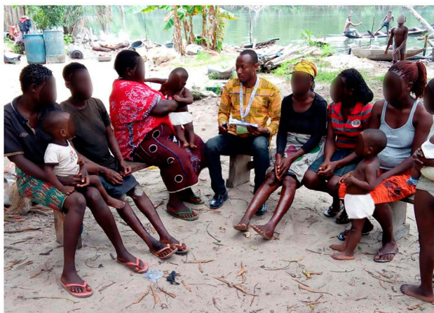
Figure 1 An FGD with women of reproductive age.

The IDI guide designed for healthcare providers contained 11 questions relating to the perception of the health risk and threat of oil pollution on the health of pregnant