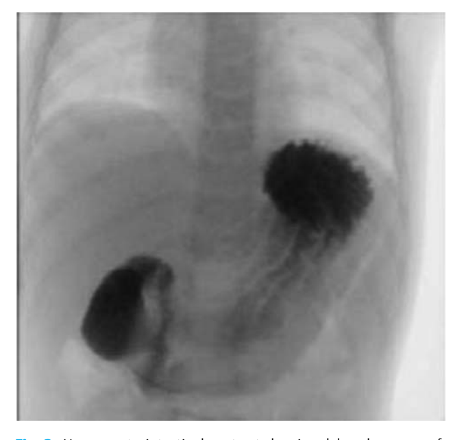
Fig. 2 Upper gastrointestinal contrast showing delayed passage of contrast from the stomach into the duodenum.

Therefore, the presenting symptoms and time of diagnosis can vary between cases according to the degree of obstruction and associated comorbidities. Prenatal diagnosis may be possible in cases with a dilated stomach, absence of a double bubble sign, and presence of polyhydramnios, as reported in 50% of cases in the last trimester. However, the findings were