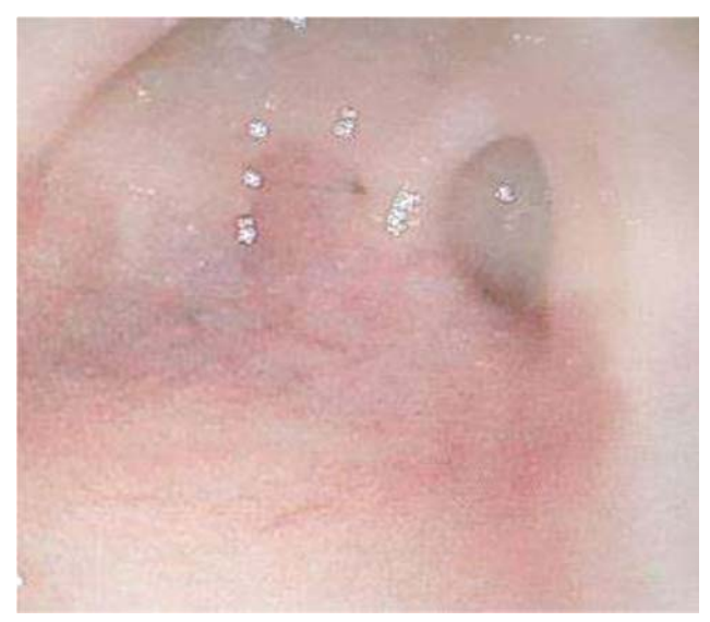
Fig. 3 Esophagogastroduodenoscopy showing a pyloric web with a tiny hole and inflammation in the stomach.