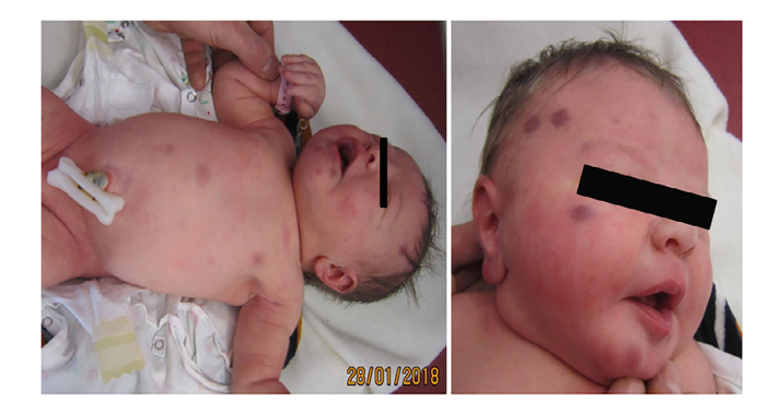
FIGURE 1 Red-violaceous papulo-nodular lesions in the face and the trunk. The lesions were firm on palpation, not pulsatile. The most voluminous measured 2 cm in diameter, in the middle area of the scalp.

abdominopelvic ultrasound, fundus, and chest X-ray) were normal. Given these overall results, the patient was released from hospitalization and bi-weekly follow-up with biological assessment was recommended.