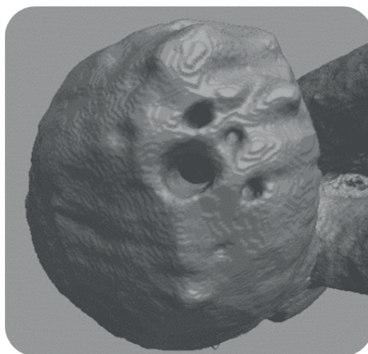
Figure 2. Complex multiple apical ramifications in a delta constriction.