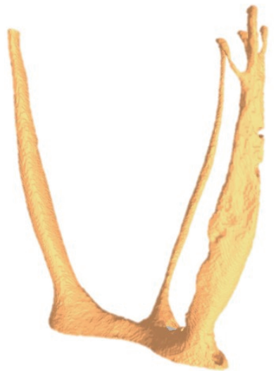
Figure 5. Presence of accessory canals in a first mesio-buccal canal.