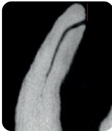
Figure 4. Lateral view of the anatomic apex showing apical foramen deviation.