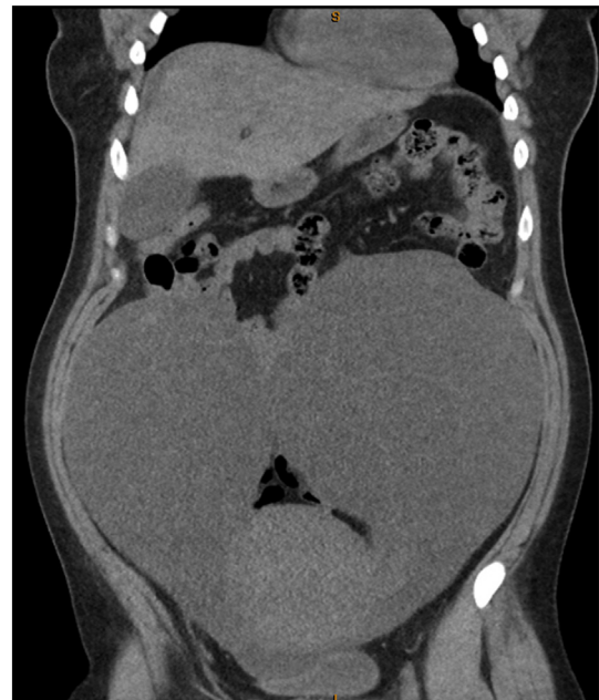
Fig. 2. Computerized axial tomography after uterine curettage. Coronal cut confirming the increase in the size of both ovaries.

The etiology of HL is unknown, but is believed to be related either to increased levels of \beta -hCG or to an abnormal ovarian response to normal levels [1,5] HL is frequently clinically asymptomatic, although it can cause pain due to rupture, ovarian torsion, or hemorrhage [6]. The incidence of ovarian tumors during pregnancy is 1 in 1000 [7].