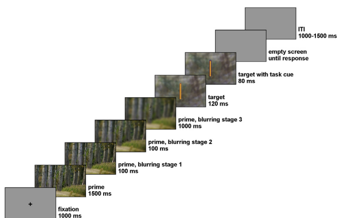
Figure 1. Time course of an experimental trial.

measured at electrode locations F9 and F10, and the vertical EOG was acquired from Fp1 and an additional electrode placed below the left eye. Two additional electrodes were attached to the left and right mastoids. The electrode on the left mastoid bone served as an online reference, and data were re-referenced offline to the average of left and right mastoids. Electrode impedances were kept below 5 kΩ. The sampling rate during data acquisition was 500 Hz.