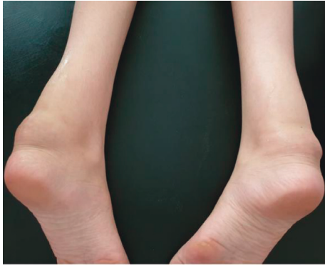
FIGURE 1: Bilateral and symmetrical hypertrophy of Achilles tendon.

range: 2–10), and plasma and urine bile alcohol levels were elevated. Reference range of plasma cholestanol matches those reported in the study of Gelzo et al. [6]. The analysis of plasma cholestanol was performed by gas chromatography coupled with a flame ionization detector (GC-FID). Total cholesterol, triglycerides, LDL-C, and HDL-C levels were normal. CYP27A1 gene mutation was not done due to lack of accessibility.