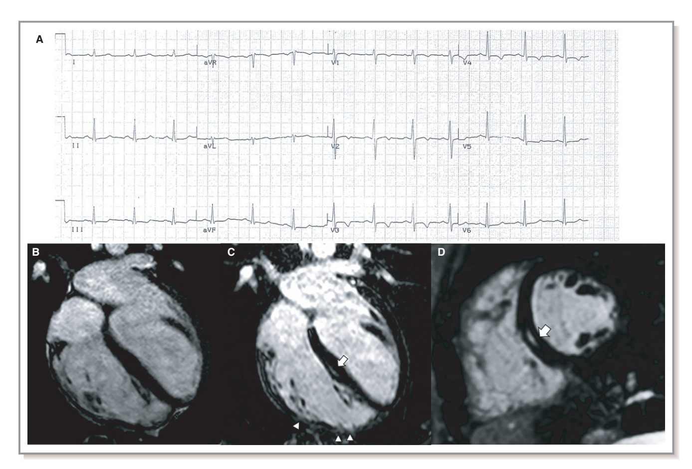
Figure 1. Electrocardiographic and contrast-enhanced cardiac magnetic resonance (CMR) findings of a representative case of right-dominant (classic) arrhythmogenic cardiomyopathy variant. A , Basal ECG showing T-wave inversion in right precordial leads (V1-V4). B , End-diastolic frame of cine CMR sequence in long-axis 4-chamber view showing a dilated right ventricle (end diastolic volume, 127 mL/m²) with a severely reduced ejection fraction (25%). The postcontrast orthogonal images in long-axis ( C ) and short-axis ( D ) views show late gadolinium enhancement as midwall stria in the midseptum (white arrow). In C , late gadolinium enhancement is also visible in the anterolateral, mid, and apical regions of the right ventricular wall, with segmental transmural involvement (white arrowheads) associated with regional dyskinesia (not shown).

intraventricular conduction, in which the underlying substrate consists of regions of surviving myocardium interspersed with fatty and fibrous tissue. These can cause fragmentation of the electric activation of the ventricular myocardium and predispose to reentrant ventricular arrhythmias. Experimental studies have showed that susceptible desmosomal-gene carriers may harbor arrhythmogenic mechanisms at a molecular and cellular level because of a cross talk between altered desmosomes and both voltage-gated sodium-channel and gap junction proteins. 19-21 Loss of expression of desmosomal proteins may induce electrical ventricular instability by a concomitant sodium channel dysfunction with current reduction, as a consequence of the interaction of these molecules at the intercalated discs. These findings have raised concerns that desmosomal-gene mutation carriers may experience lifethreatening ventricular arrhythmias before fibrofatty myocardial replacement, structural/functional ventricular abnormalities develop, and sudden cardiac death may occur during the so-called concealed phase of the disease. However, clinical