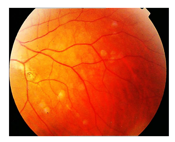
Figure 2. Grouped CHRPE: The Sectorial Pattern of Grouped CHRPE with Smaller and Lager Lesions in the Periphery (OS) with Peripheral Halo Depigmentation.