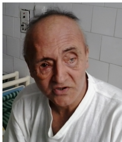
Figure 5. Resorption of the orbital tumors after chemotherapy

The patient was diagnosed with stage IVB diffuse large B-cell primary orbital lymphoma and R-CHOP (Rituximab + Cyclophosphamide, Adriablastin, Vincristin and Prednison) chemotherapy was started, which produced a rapid response. After 2 months, the patient presented with relapse. R-ICE (Rituximab + Iphosphamide, Carboplatin and Etoposide) second-line chemotherapy was started and complete remission was obtained after 4 cycles (fig. 5). However, the patient did not regain his vision due to optic nerve atrophy. He did not return for completion of the chemotherapy cycles, nor for follow-up.