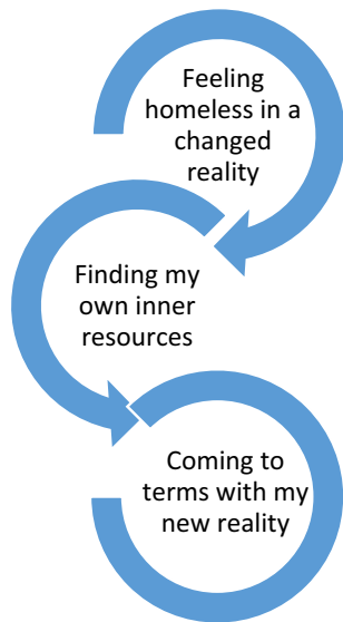
FIGURE 2 Main theme describing the process of navigating from helplessness to feeling strong in a new reality