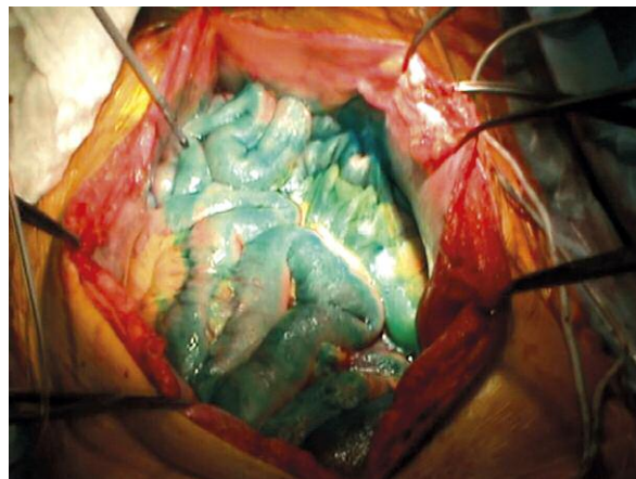
Photo 2. Abdominal cavity after administration of SprayShield™. The blue color was helpful in visual control of the correct administration on the surface of the viscera

signs and physical examinations, and quantitative laboratory tests. Any laboratory evaluations that were determined to be both outside the normal range for the institution involved and clinically significant (based on the investigator's assessment) were documented as adverse events. For each reported adverse event, the investigator was required to determine if there was a relationship between the study treatment and the event. The relationship could be rated as "no relationship," "possible relationship", "definite relationship", or "unknown/impossible to determine."