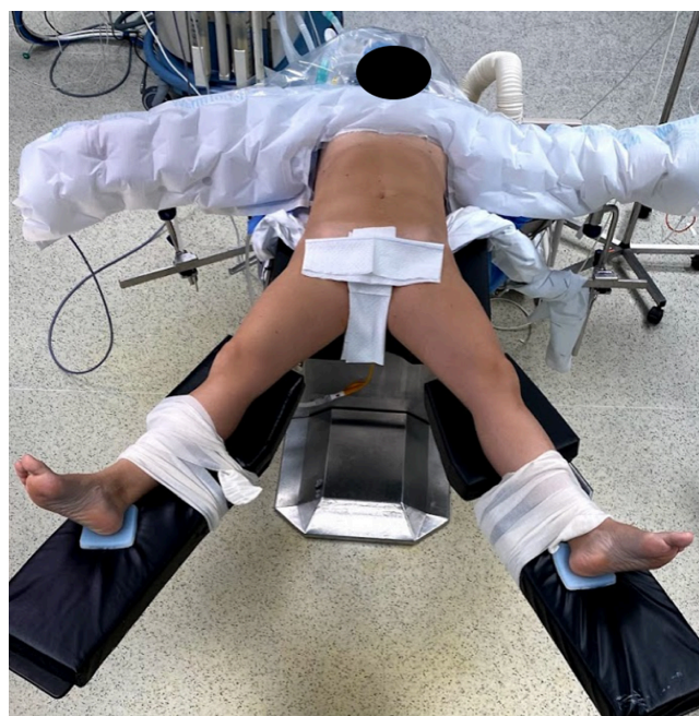
Figure 5 Da Vinci position for anterior approach to lumbar spine.

The posterior approach is the most performed in lumbar spine surgery. It has some advantages over the anterior