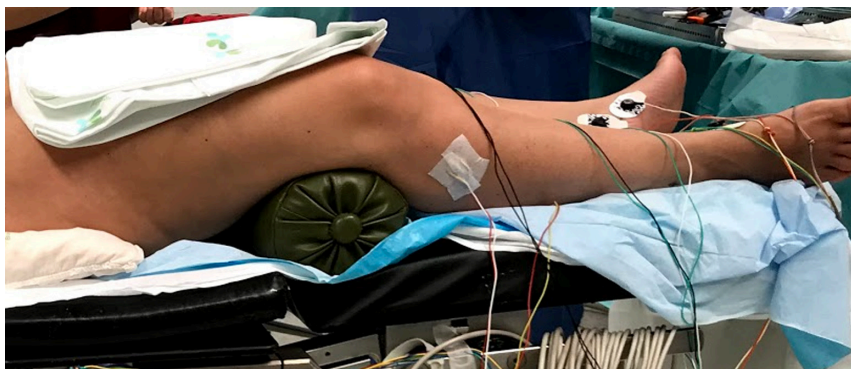
Figure 3 Leg position in supine decubitus.

Brachial plexus injury is also a concern of mispositioning of patients on surgical table. In the supine position,