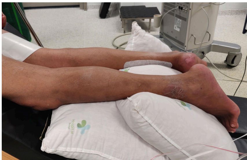
Figure 8 Leg and foot position in ventral decubitus.

tilting. The four pillars support the lateral thoracic cage and the antero-lateral pelvis. The head rests on a foam pillow. The arms are placed in padded arm supports, in a neutral position alongside the head. Hips are flexed at a 60° angle, the knees should lie on a gel pad and the feet are supported by a pillow, pointing downwards (21, 29, 33, 34).