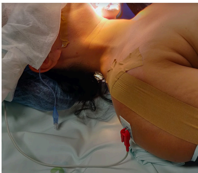
Figure 1 Neck position for anterior approach of the cervical spine.

To facilitate the exposure, the neck should be put into slight hyperextension. This position allows for a larger working area and opens up the intervertebral disc spaces anteriorly. A shoulder roll is placed between shoulder blades, under the cervicothoracic junction. In the anterolateral approach, the neck should be rotated to the left or to the right, depending on the choice of the surgeon. This position can be achieved by elevating the ipsilateral shoulder with a rolled blanket or a pillow (1) (Fig. 1).