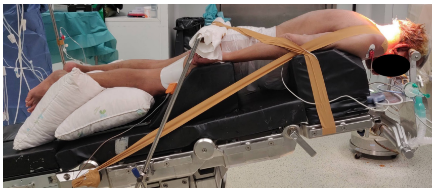
Figure 6 Concorde position for posterior approach to cervical spine.

approach such as earlier identification of the spinal cord, treatment of the posterior elements disorders and better correction of spinal imbalances. It is indicated in the treatment of symptomatic disc herniation, segmental instability as a result of trauma, tumors or listhesis. Posterior lumbar spine surgery can be made either by classic posterior/posterolateral approaches like the midline posterior approach and the paramedian approach or by minimal invasive percutaneous techniques (7, 15, 19, 28).