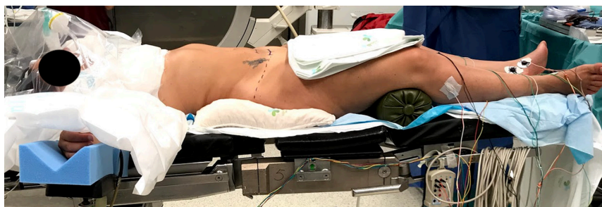
Figure 4 Supine position in lumbar spine surgery.

the brachial plexus is more at risk of stretching than compression. Excessive strain of the neck in the lateral flexion or excessive traction on the shoulder can lead to stretching and injury of the brachial plexus (6, 16). The best way to prevent brachial plexopathy is to prevent over traction of the shoulders or limit shoulder abduction to a maximum of 90°. Excessive lateral rotation of the head to one side should also be avoided to prevent stretching of contralateral brachial plexus (5, 17, 21, 26).