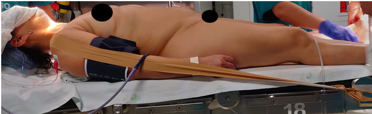
Figure 2 Supine position for anterior approach of the cervical spine.

of them are related to the neck position (lateral flexion or hyperextension). Peripheral neuropathies (especially affecting the ulnar nerve) result from poor padding of pressure points (1).