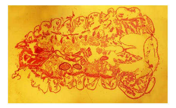
Fig. 3. Cross-sections Gasterphilus larvae (10x), H and E