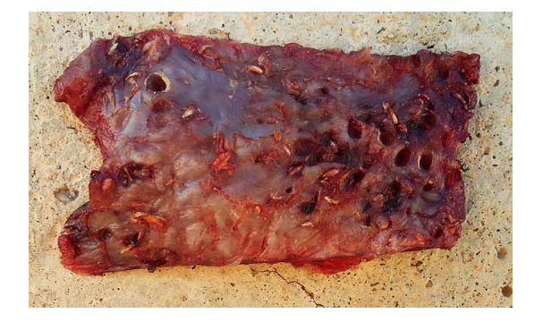
Fig. 2. Gasterphilus larvae on the esophageal mucosal membrane of an onager