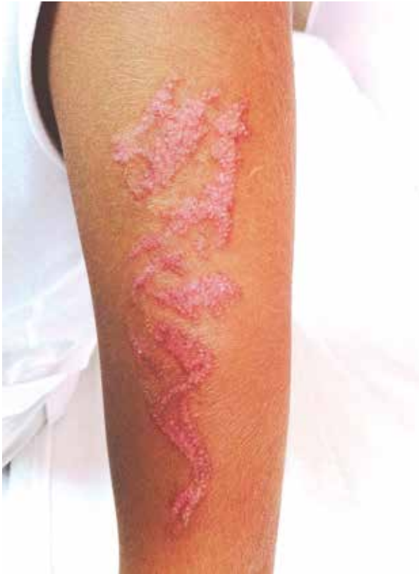
Figure 1. Erythematous, edematous, papulonodular lesions on the tattoo area