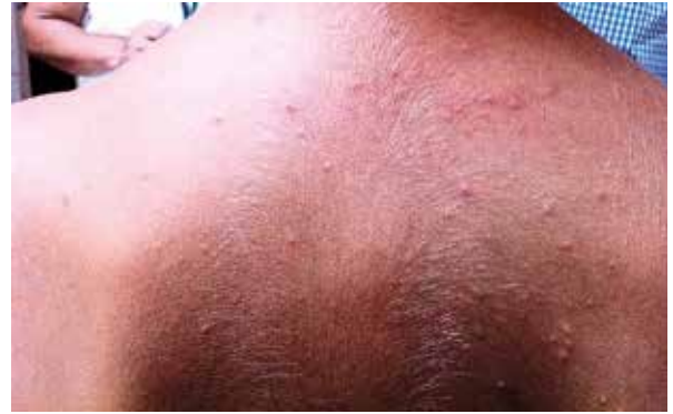
Figure 2. Erythematous, edematous papules on the back