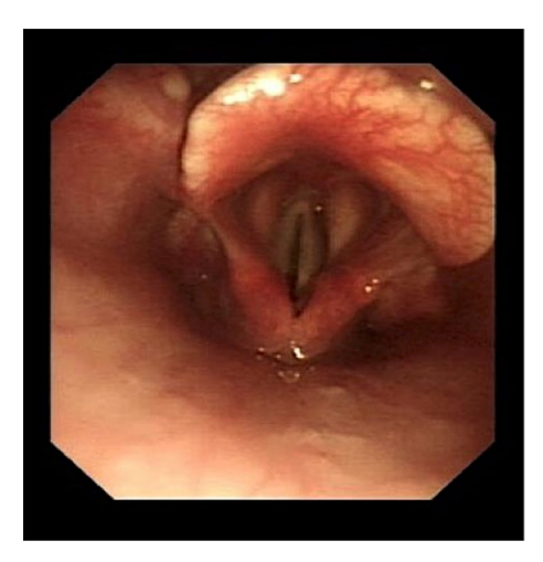
Fig. 2 Visualization of the epiglottis

of nasal intubation due to narrow nasal passages [12]; in the past we routinely assessed nasal patency pretreatment with a 14/16 French nasal catheter prior to attempting intubation, this, however, is no longer considered necessary,