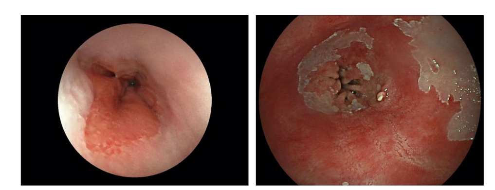
Fig. 4 Advances in TNE field of view. 120° (left image) versus 140° field of view (right image) of esophagogastric junction captured by two different TNE endoscopes using the same Endoscopy Video Processor

Endoscopy is a key diagnostic tool for Barrett's esophagus. While screening of patients with gastro-esophageal reflux symptoms for Barrett's esophagus is not currently recommended by the British Society of Gastroenterology (BSG) [27], it is acknowledged that uTNE may have a role to play if we were to introduce a screening program among a high-risk population (e.g., male, > 50, white race, obese). When the BSG guidelines were written in 2013 it was felt that