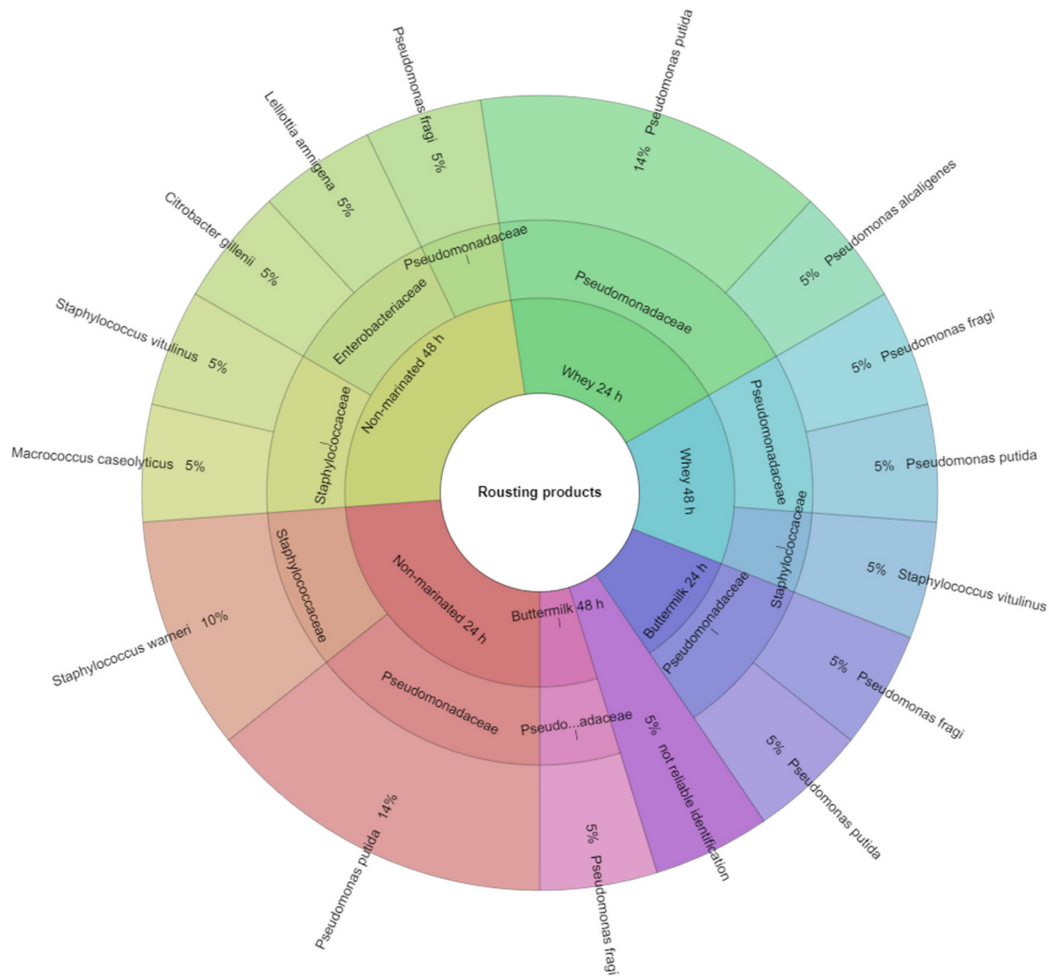
Figure 2. Identified species and family of bacteria isolated in the roast products.