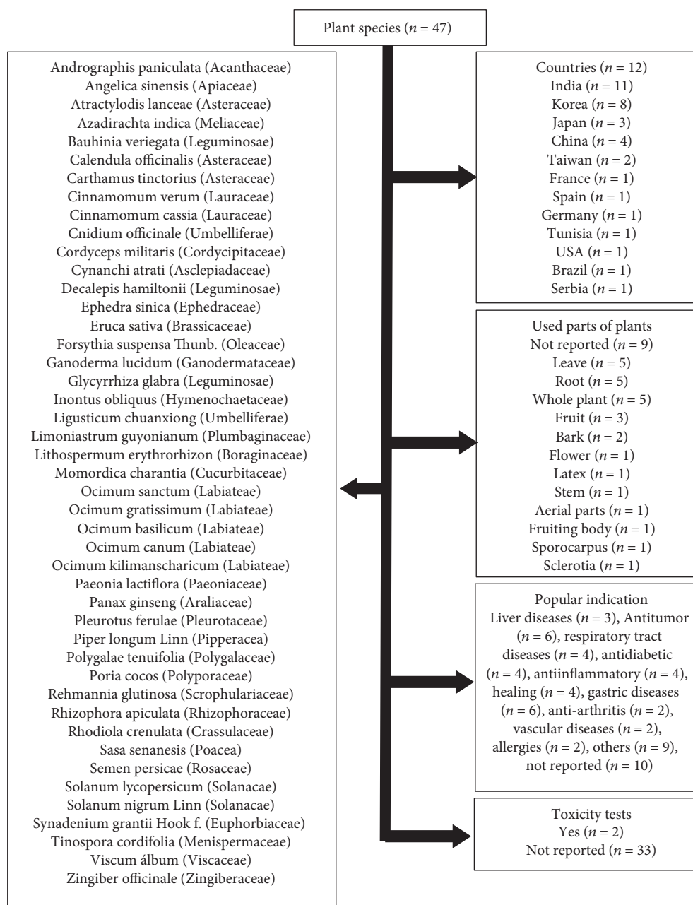
FIGURE 2: Summary of the studies describing the plant species, families, used parts of plants, toxicity tests, and popular indications.

did not report the plant family. The most used plant structures were roots ( n = 5 ), leaves ( n = 5 ), and the whole plant ( n = 5 ), followed by fruits ( n = 3 ) and barks ( n = 2 ). Many of the studies ( n = 9 ) did not mention this information. Only 2 studies reported toxicity tests. The main results for plant species, families, used parts of plants, toxicity tests, and popular indications are shown in Figure 2.