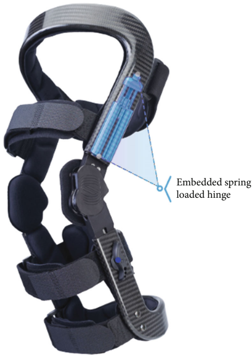
FIGURE 1: Image of the tricompartment offloader (TCO) knee brace with spring-loaded hinge.

knee OA, so clinical practice guidelines recommend conservative, nonsurgical, and nonpharmacological treatment strategies as the first-line treatment for disease management and pain reduction [12, 13].