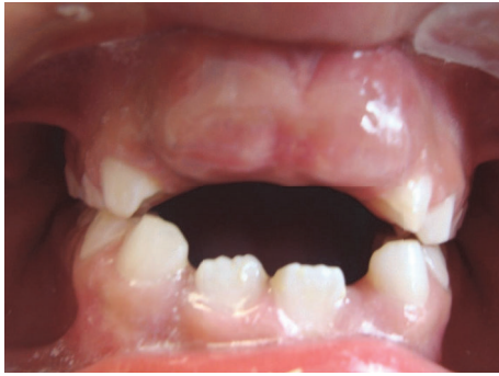
FIGURE 1: Initial frontal view.