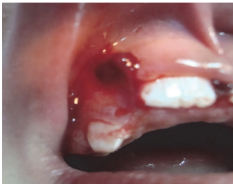
FIGURE 3: 3-day postoperative view. The right suture was removed. The wound was resutured.