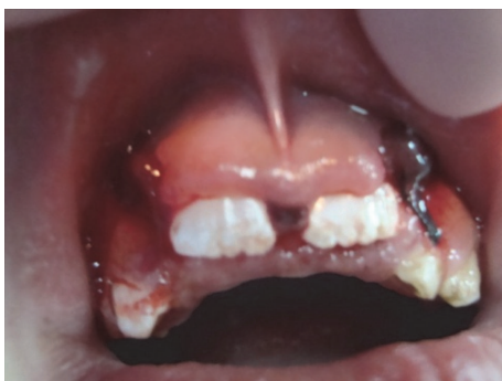
FIGURE 4: 2 days later. The new suture was also retired and then resutured. Pharmacological treatment was initiated intravenously.

mild/moderate hemophilia, prior to dental treatment; this vasoactive drug has demonstrated an up to 4.7-fold increase of factor VIII level in plasma, sufficient to allow a safe oral management [23].