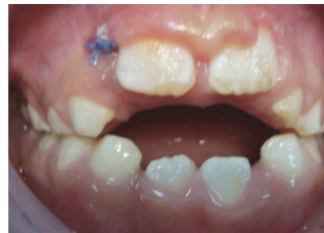
FIGURE 5: Final view after 8 hours of treatment. Bleeding was finally controlled.