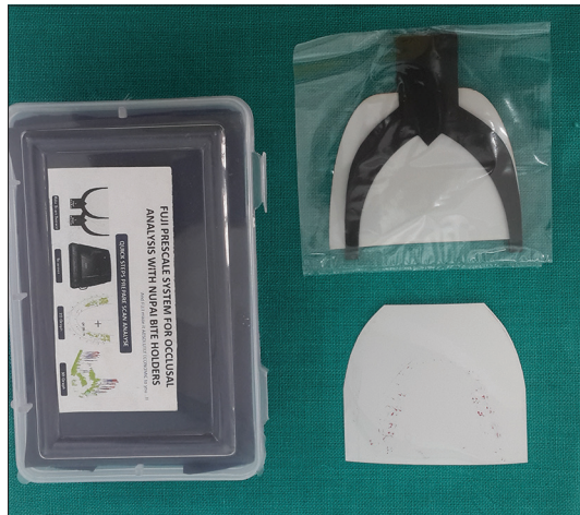
Figure 1: Sensor with sensor holder

to clench on the sensor in a maximum intercuspal position for 5 s at maximal clenching level in the two head positions using goniometer [Figure 3a and b].