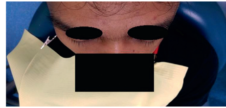
FIGURE 2: Bird's eye view showed the absence of enophthalmos.

However, it was also noticeable to us that the fractured lateral wall of maxillary sinus was displaced medially along with some lateral soft tissue components. All muscles especially the lateral and inferior extraocular muscles appeared normal. Close follow-up was advocated in this case. At one month after trauma, the patient's eye movements remained intact, and there were no diplopia and apparent enophthalmos. Given these clinical findings, he was subjected to