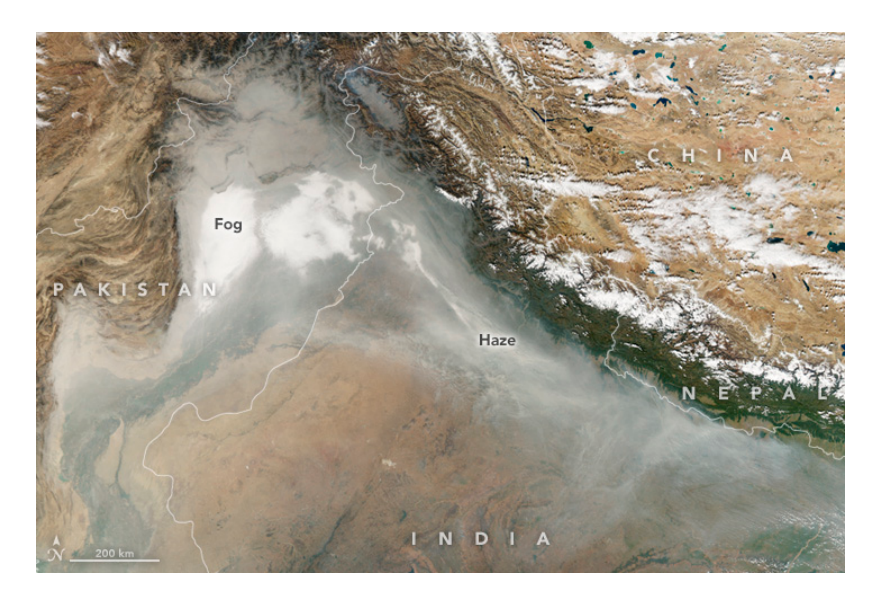
Figure 1. NASA Earth Observatory image of fog and haze distribution over the Northern States of India on 8 November 2017 [54].

paddy residue in the Patiala district of Punjab was estimated to be around 60 to 390 mg/m<sup>3</sup> [22]. During the period of October 2017, smoke from crop residue burning in Punjab and Haryana blows across northern India and Pakistan. With the onset of cooler weather in November, the smoke, mixed with fog, dust, and industrial pollution, forms a thick haze. Wind usually helps disperse air pollution, and the lack of it, worsens the problem for several days as was the case during November 2017. Several major cities—including Lahore, New Delhi, Lucknow, and Kanpur—faced elevated levels of pollution [54]. On 7 November 2017, the Moderate Resolution Imaging Spectro-Radiometer (MODIS) of NASA's Aqua satellite captured a natural-color image of haze and fog blanketing the northen states region of India (Figure 1).